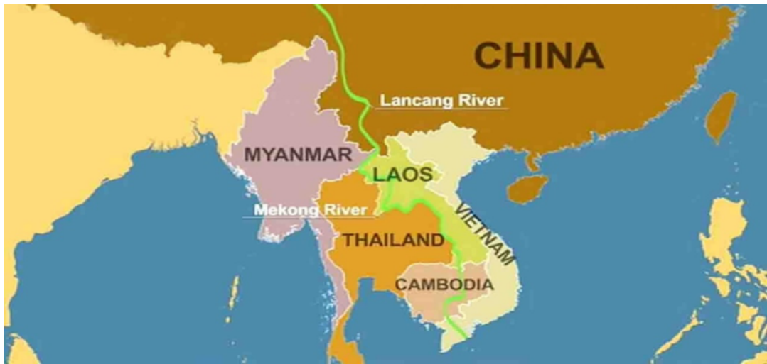
The Lancang-Mekong River Basin