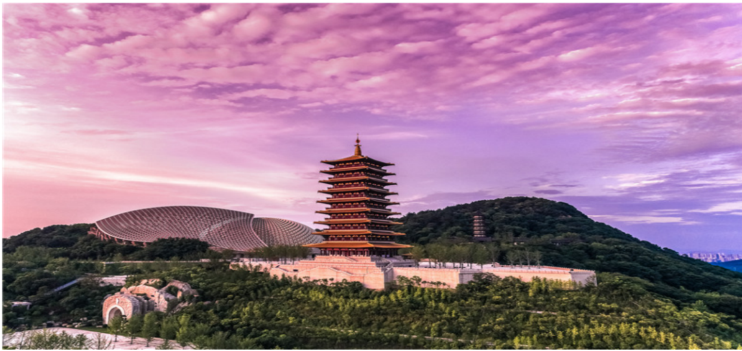
Nanjing Niushou Mountain