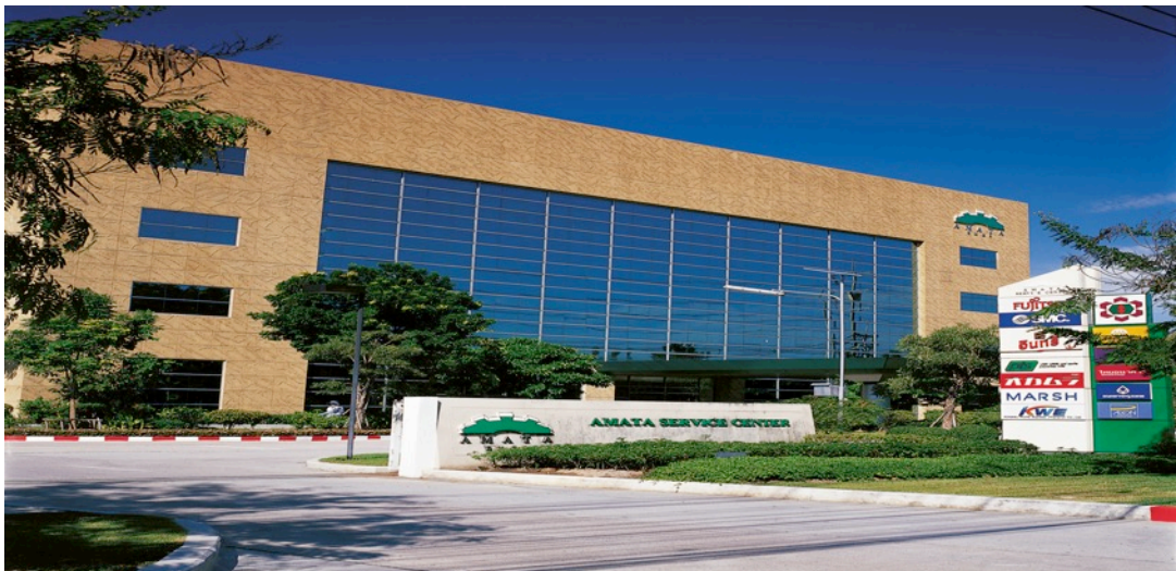
Amata Corporation PCL